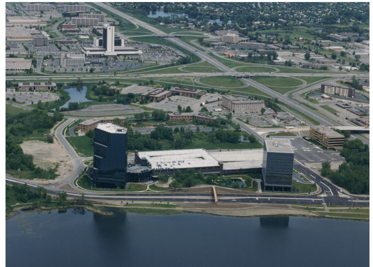
NLOP circa 1985

Today Bloomington is the fifth largest city in Minnesota according to 2016 estimates. It is the home of the Mall of America, the largest mall in the United States.